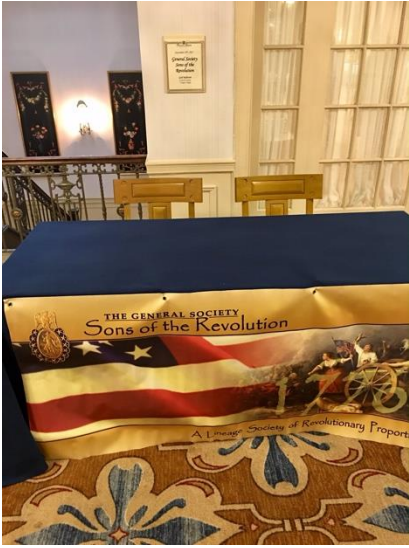
Business Session I Friday 9/29