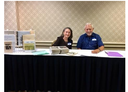
Registration Display by Three Rivers Genealogical Society, Lake City, SC