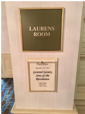
Registration: 9/28 and 9/29