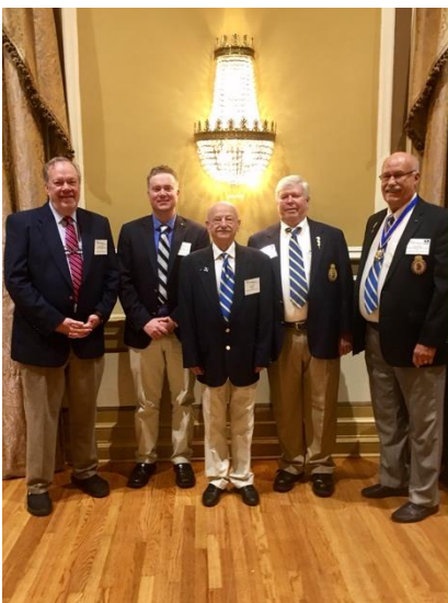
Five of Seven SC SR Members Group Photo 9/29