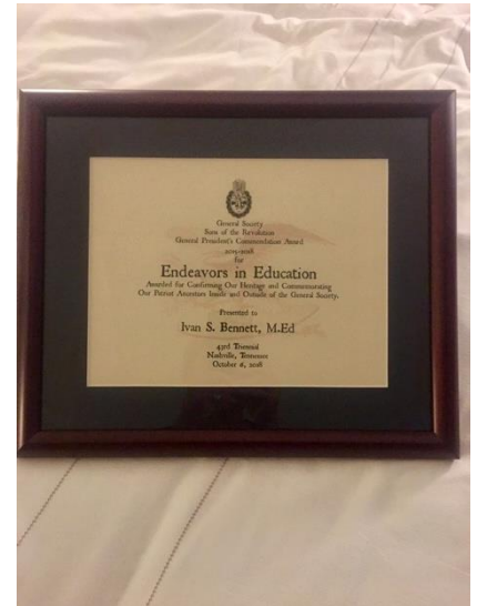
General President Commendation Award 2015-2018 Endeavors in Education