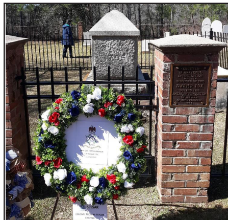
Our wreath at the Francis Marion Memorial